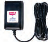
DC Adapter (20vdc and 1.2 Amps)