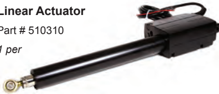
Linear Actuator Part # 510310 1 per