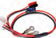
Plug N Go Harness